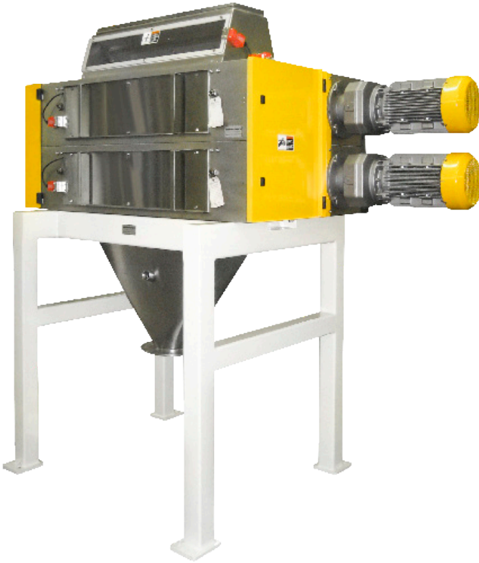
Model IMD 800 Gran-U-Lizer with Rotary Feeder

MPE's high capacity Model IMD 800 Series Roller-Style Gran-U-Lizers provide precisely-controlled uniform particle size distributions with minimal unwanted "fines", even in the most demanding of applications. The IMD 800 is designed for industrial food, chemical and mineral processing applications where exact particle size distributions are desired.