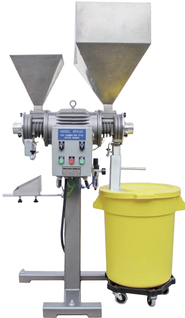
Model GPX.DC Coffee Grinder

The Model GPX.DC features two identical grinding chambers in one grinder design. Dedicate sides for organics, decafs, flavors or more without having to worry about cleanout or cross contamination. The GPX.DC uses 5.5 inch diameter "diamond hard" grinding discs that are precision-cut to optimize cutting action with infinite adjustment control, resulting in a cool, uniform coffee grind for optimal brew performance.