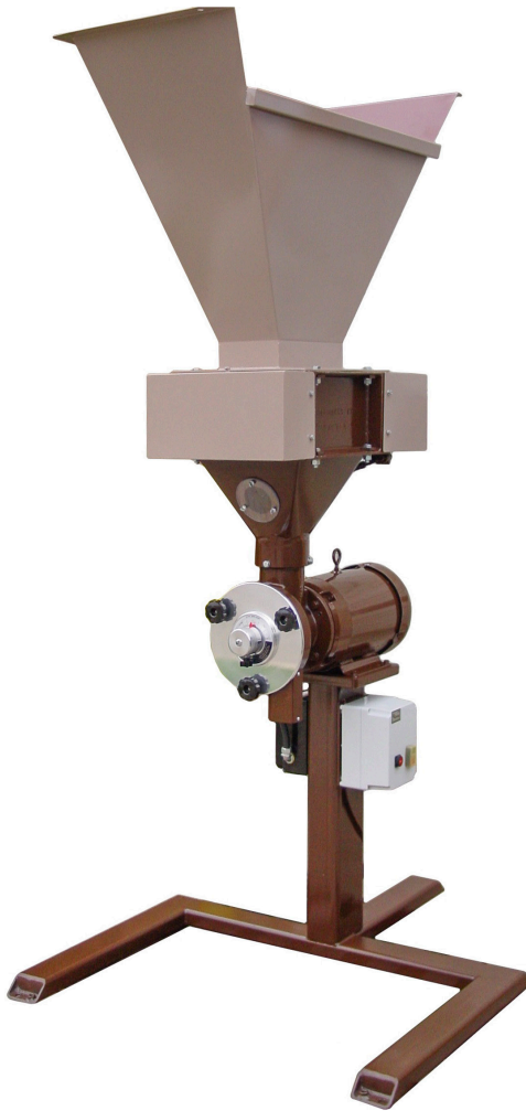
Model DL-140 Delumping Grinder

The model DL-140 combines a lumpbreaker and precision disc-style grinder into one simple-to-operate unit. The lumpbreaker is designed to handle material as large as 6 inches in diameter and integrates seamlessly with the disc grinder. Final target grind sizes typically range from 1/8" to 150 mesh.