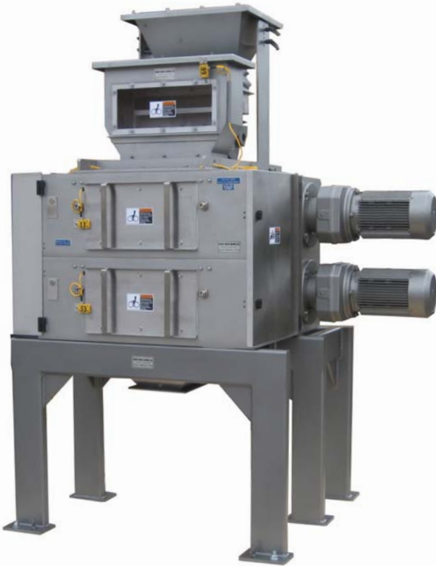
Model IMD 79 DP (Double Pair) Granulizer with Vibratory Feeder

Modular Design for High Accuracy Cracking, Grinding and Crushing Applications