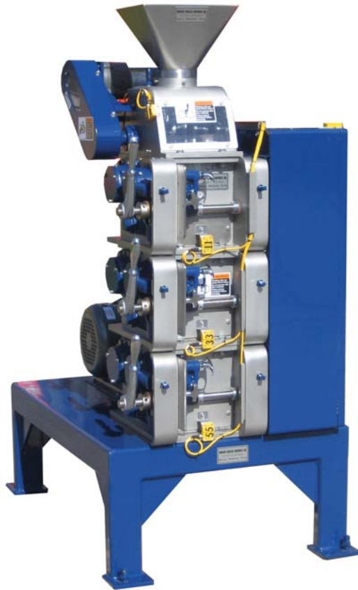
Model 600 Gran-U-Lizer with Rotary Feeder

Designed for High Accuracy Grinding and Crushing Applications