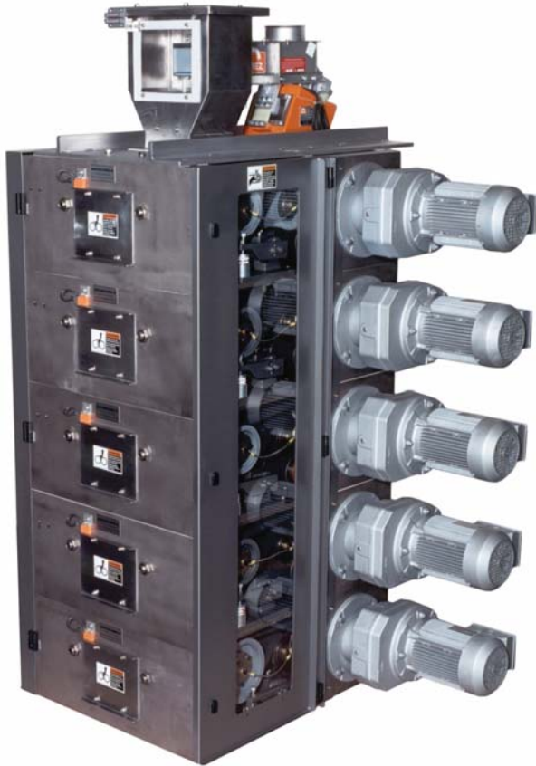
Model IMD 69.5 Granulizer with Vibratory Feeder

Modular Design for High Accuracy Cracking, Grinding and Crushing Applications