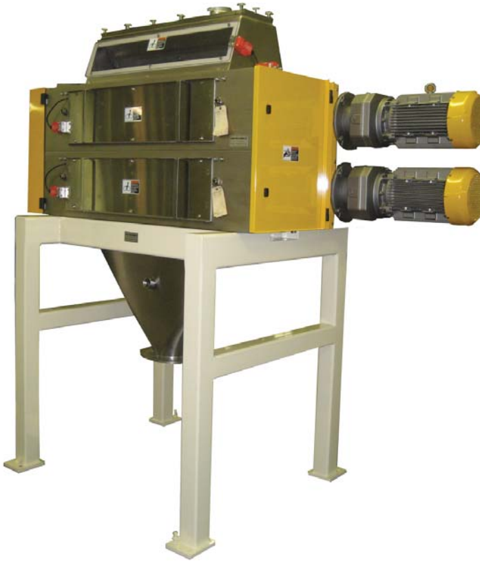
Model IMD 800 Gran-U-Lizer with Rotary Feeder

Modular Design for High Accuracy Cracking, Grinding and Crushing Applications