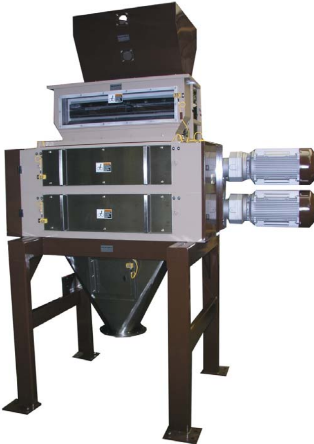
Model IMD 99 Gran-U-Lizer with Vibratory Feeder

Modular Design for High Accuracy Cracking, Grinding and Crushing Applications