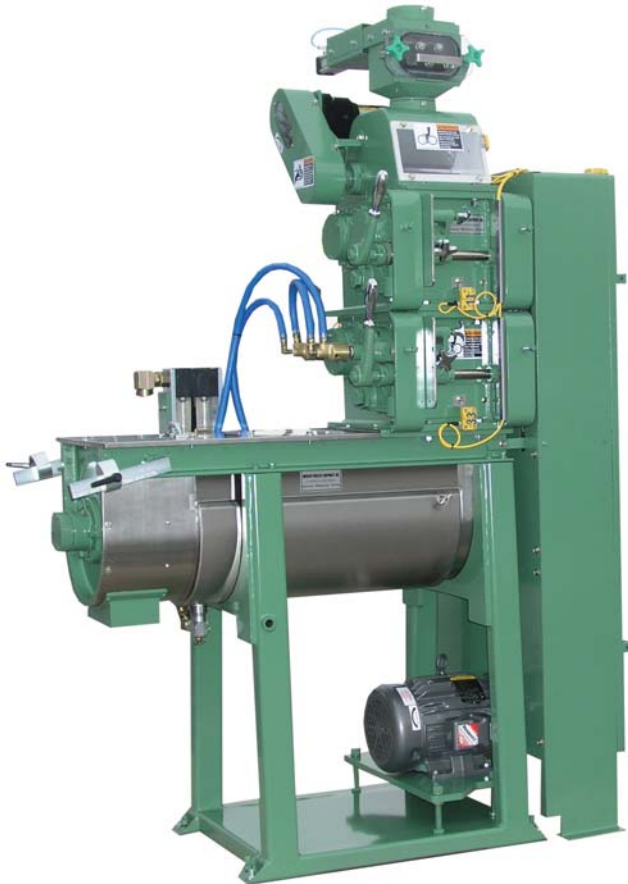
Model 600 FX.WC (Water-Cooled) Coffee Granulizer Two (2) Grinding Section Configuration with Integrated Normalizer

PRECISION GRINDING Technology for Industrial Coffee Applications