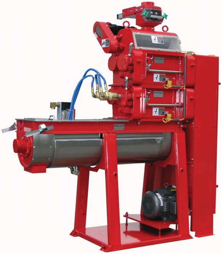
Model 700 FX.WC (Water-Cooled) Coffee Granulizer Two (2) Grinding Section Configuration with Integrated Normalizer

PRECISION GRINDING Technology for Industrial Coffee Applications