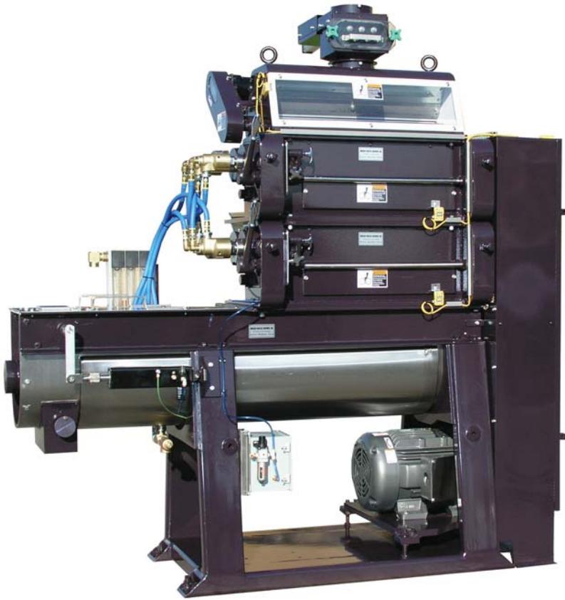
Model 800 FX.WC (Water-Cooled) Coffee Granulizer Two (2) Grinding Section Configuration with Integrated Normalizer

PRECISION GRINDING Technology for High-Capacity Applications